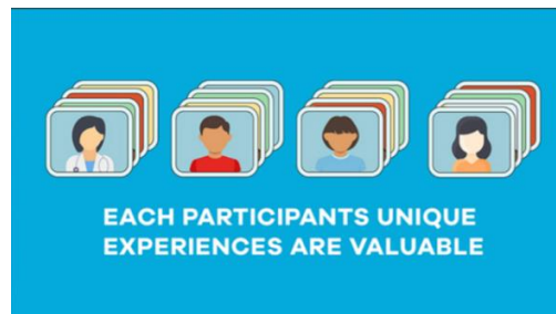
Example of Concept for Recruitment Video