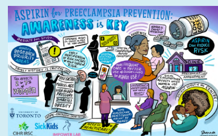
Graphic recording of the town hall discussion

Recommended articles which were included in the scoping review: Chambers et al. , Mackintosh et al.